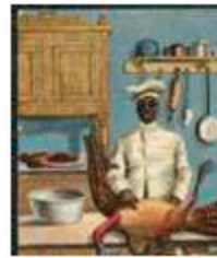
Pumpkin Pie Cake